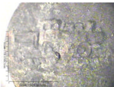
Button found at Dunham excavation site—Can you see the train? Did it belong to a railroad worker?